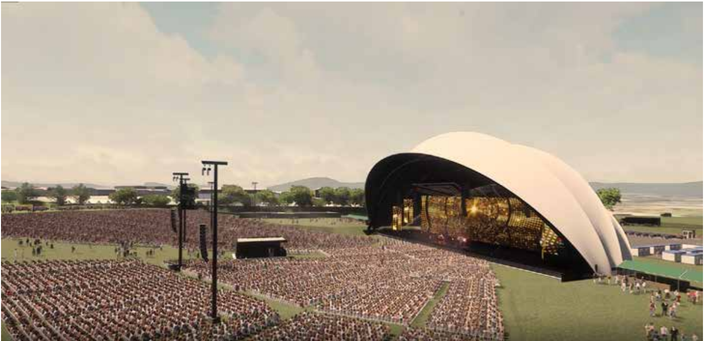
Cedar Mill Morisset site (supplied).