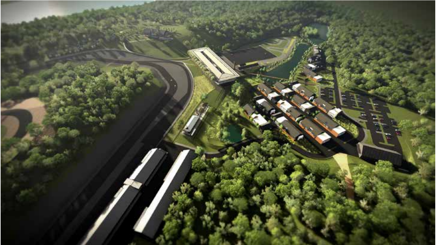
Blackrock site.